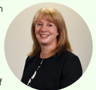
Shona Robison Cabinet Secretary for Finance and Local Government

As a result, we worked at pace to ensure funding commitments for 2026-27 were progressed through our financial processes before the pre-election period commenced.